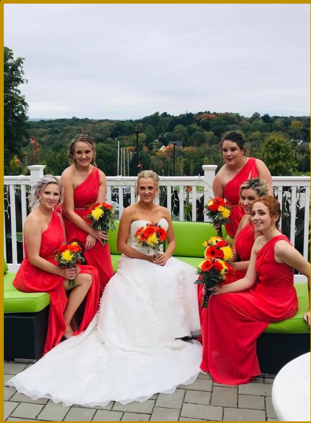
HIGHFIELDS GOLF & COUNTRY CLUB